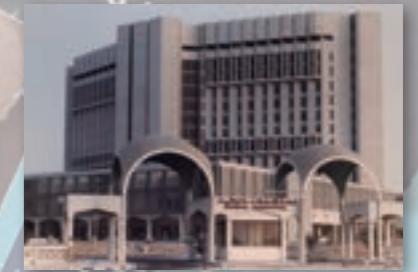
1981 New Dubai Hospital (the UAE)