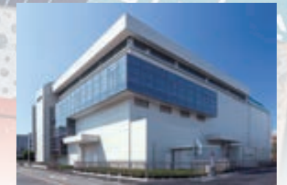
2019 Technical Center