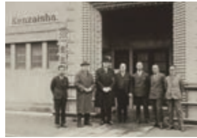
1932 Photo taken in front of the Head Office