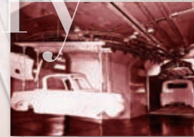
1959 Toyo Kogyo Co., Ltd. (now Mazda Motor Corporation) F Plant