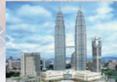
1994 Petronas Twin Towers (Malaysia)