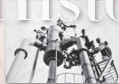
1935 Steam jet units