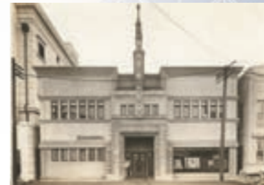
1927 Our company building