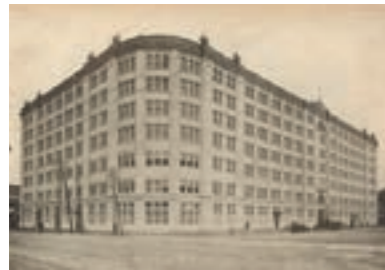
1918 Tokio Marine and Fire Insurance Building

110 years since its foundation in 1913, Taikisha Group has evolved into a global company group, employing over 5,000 people. We will keep challenging ourselves while maintaining our global nature and the “Customers First” philosophy inherited since the foundation.