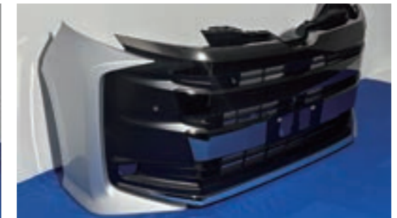
A split-type molded bumper