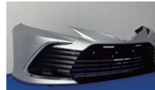
A monolithic molded bumper